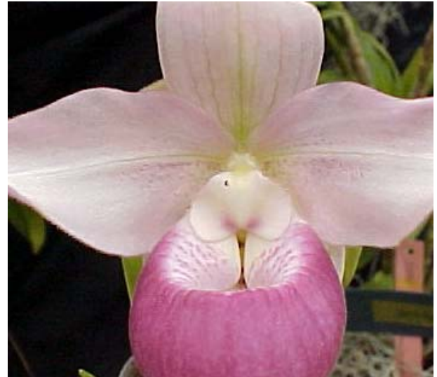
Phragmipedium Sedenii (longifolium X schlimii)