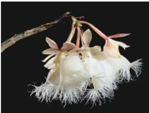
Epidendrum ilense @ Kew Gardens

Our rare plant auction on Saturday will give you an opportunity to find something here that is not easily available anywhere else. Come early for a good seat! This is our member's show, so come to see what we can do!