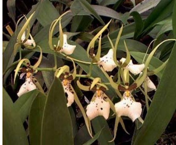
Brassia maculata

A reminder – if you are new to orchid growing, trying out some new genera or growing method, or just want to learn a little more about the plants you have – the IOS has a mentor program available to all members. Mentors names, contact information, and specialties were published in the September newsletter. So, if you're looking for a mentor or if you want to volunteer to be a mentor, contact Allen Morr.