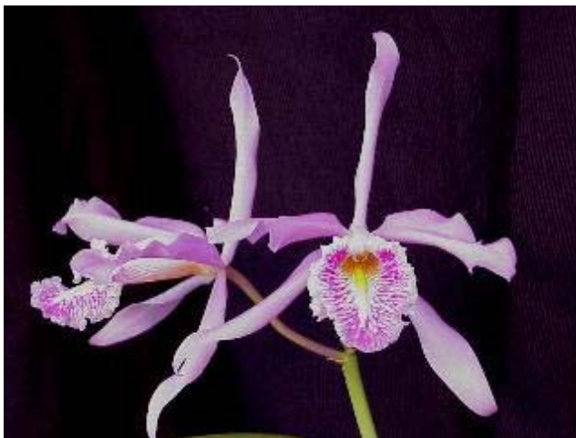
Cattleya maxima – Rick’s Orchids