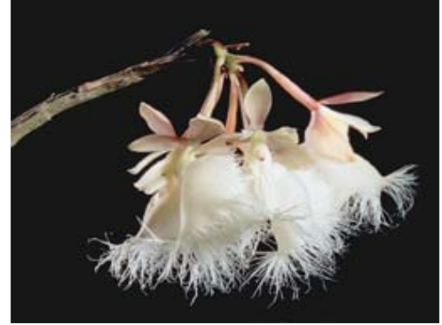
Epidendrum ilense @ Kew Gardens