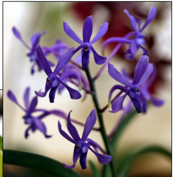
Neostylis Lou Sneary Grower: Felicia Cochran