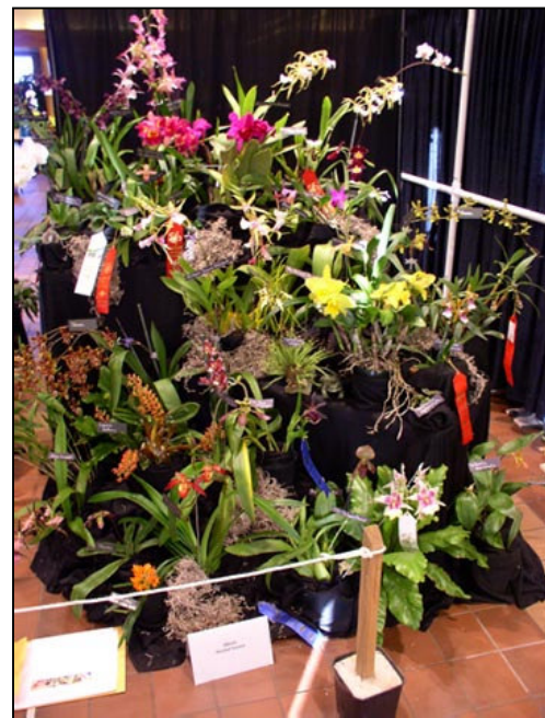
IOS Display at the Blackhawk Orchid Society show

The next show is in Madison, Feb. 3-4. If anyone has questions about away shows or would like to come along (I will have a bigger car then) email me - phrag207@earthlink.net .