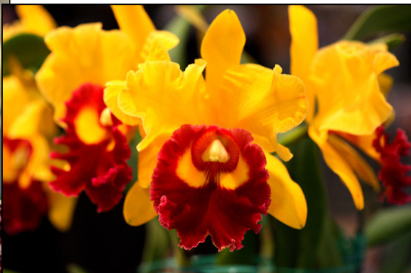
Blc. Chunyeh 'Good Life' AM/AOS