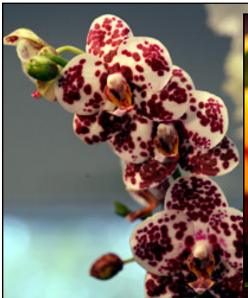
Phal. Brother Redland Spots