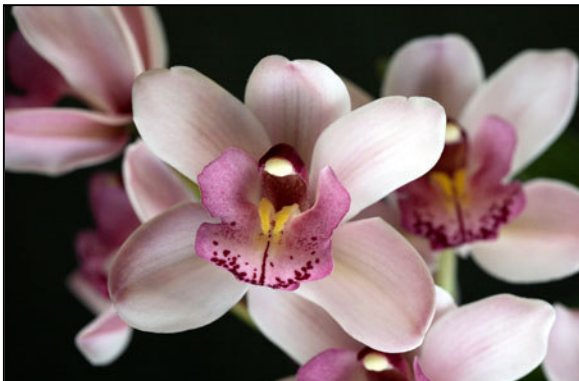
Cymbidium Twilight Pink 'Contessa'

If you have any questions or concerns, please contact me at fb72@sbcglobal.net .