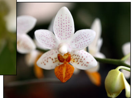
Phal. Mini Mark 'Holm'