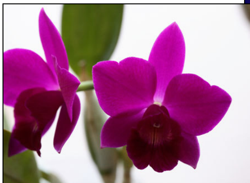
Lc. Fiery-Walkeriana x Minipurple