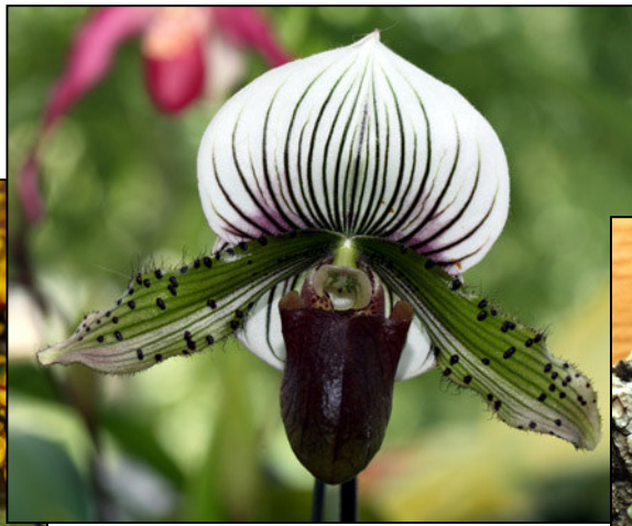
Paph Macabre x Kevin's Wine